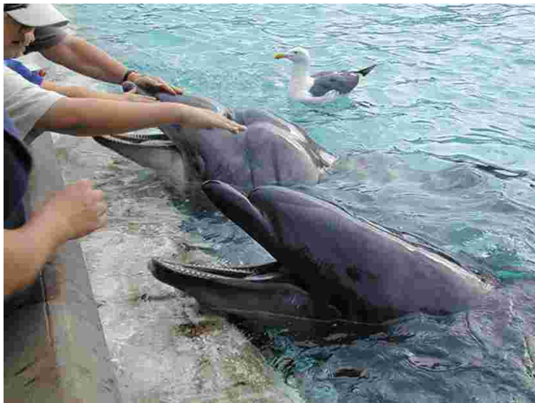
Several Petting Pool dolphins are obese, despite a legal obligation to adjust captive dolphins' food intake to ensure a "normal state of good health".

As Sea World explains on its website, its trainers use food as a 'primary reinforcer' to let an animal know when it has performed a desired behavior. In the case of unwanted behavior, the trainer remains motionless and silent for three seconds. But as the site acknowledges, "Because we really don't